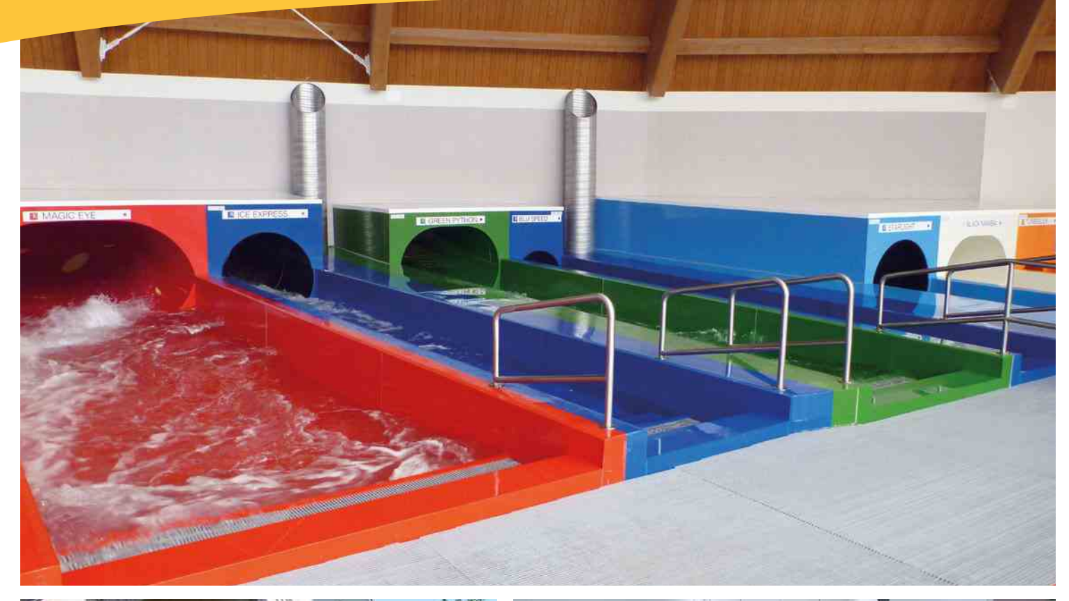
We offer expertise and years of experience to support you in planning your leisure facility

Each of our water slide models has a recommended run-out system, which is noted in the product descriptions.